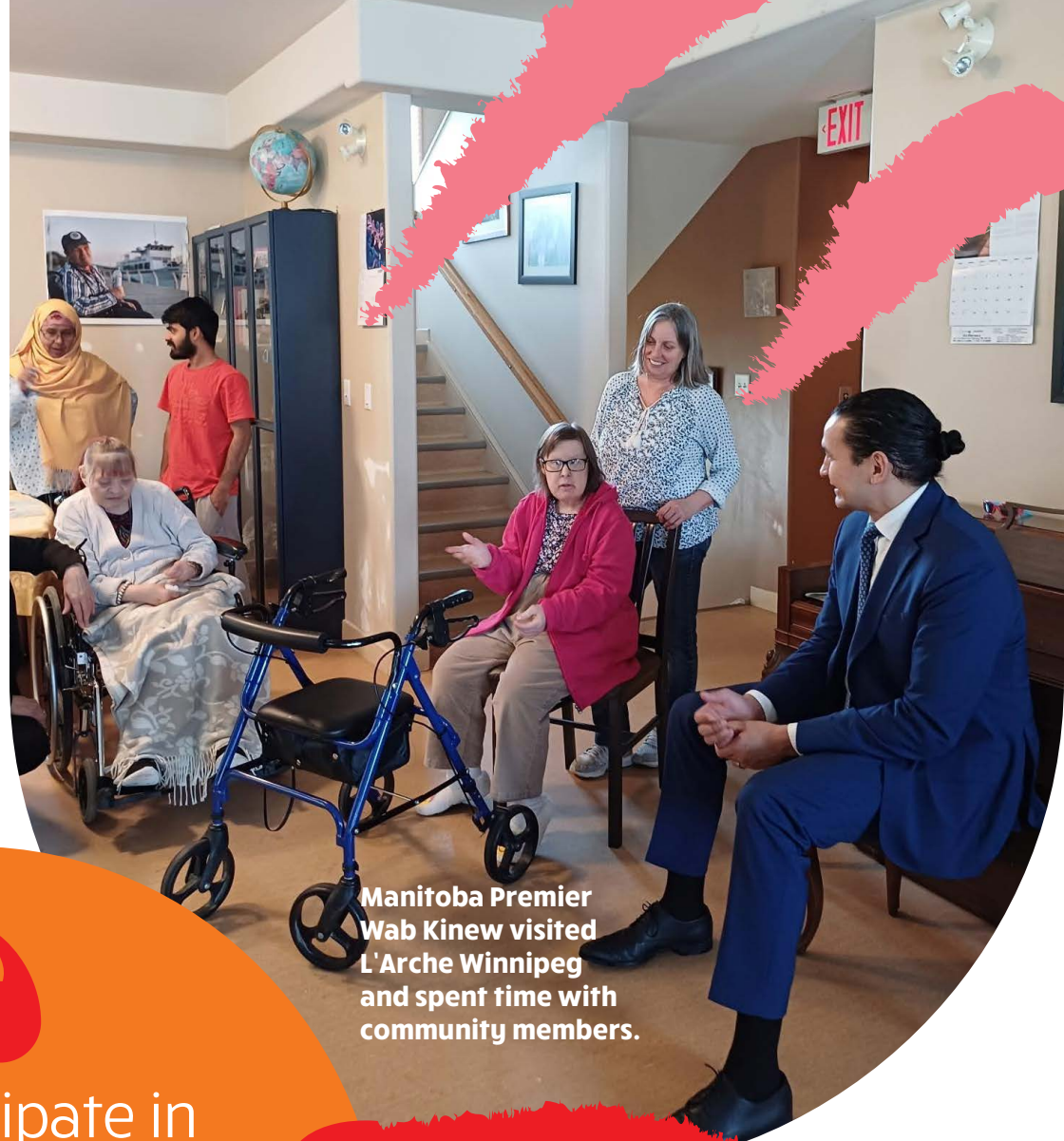
Manitoba Premier Wab Kinew visited L'Arche Winnipeg and spent time with community members.

Adapted from the Charter of the Communities of L'Arche